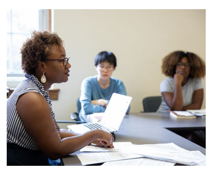
College of the Holy Cross

U.S. percentages are from the 2021 U.S. Bureau of Labor Statistics Occupational Employment Statistics and are based on faculty at U.S. postsecondary institutions that award bachelor's degrees.